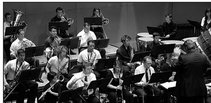
Pima Community College Wind Ensemble ▲ ▼ Flowing Wells Wind Ensemble